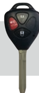
SSC Part #: 5938198 Button Function: L, U, P