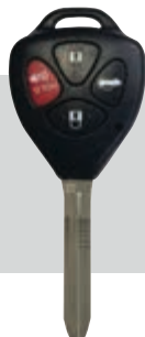
SSC Part #: 5938202 Button Function: L, U, T, P