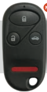
SSC Part #: 5941405 Button Function: L, U, T, P