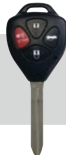
SSC Part #: 5938197 Button Function: L, U, T, P