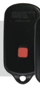
SSC Part #: 5931639 Button Function: L, U, LG, P