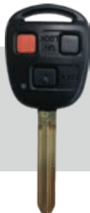
SSC Part #: 5941457 Button Function: L, U, P