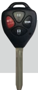
SSC Part #: 5938199 Button Function: L, U, T, P