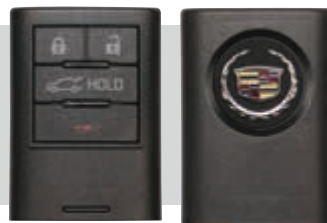
SSC Part #: 5931855 Button Function: L, U, LG, P