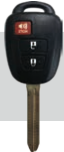
SSC Part #: 5941409 Button Function: L, U, P