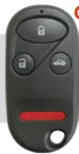
SSC Part #: 5941407 Button Function: L, U, T, P