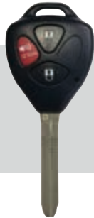
SSC Part #: 5938204 Button Function: L, U, P