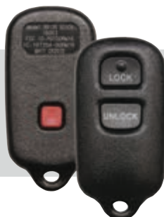
SSC Part #: 5931640 Button Function: L, U, P