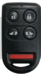
SSC Part #: 5941410 Button Function: L, U, RSD, LSD, P