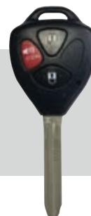
SSC Part #: 5938200 Button Function: L, U, P