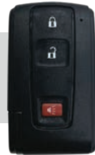
SSC Part #: 5941419 Button Function: L, U, P