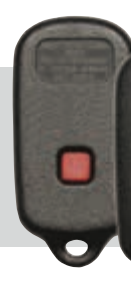
SSC Part #: 5931641 Button Function: L, U, T, P