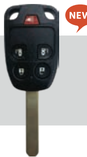
SSC Part #: 5941423 Button Function: L, U, RSD, LSD, P