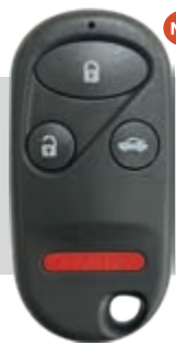
SSC Part #: 5941408 Button Function: L, U, T, P