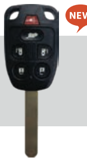
SSC Part #: 5941427 Button Function: L, U, P