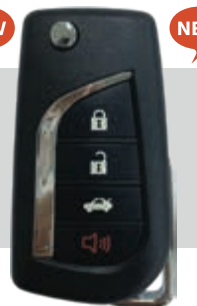
SSC Part #: 5941447 Button Function: L, U, T, P