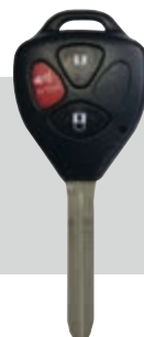
SSC Part #: 5938196 Button Function: L, U, P