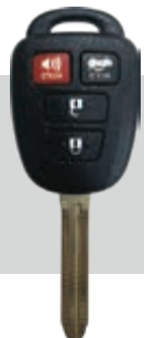
SSC Part #: 5941439 Button Function: L, U, T, P