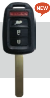
SSC Part #: 5941434 Button Function: L, U, T, P