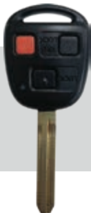
SSC Part #: 5941454 Button Function: L, U, P