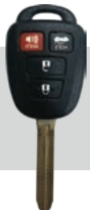
SSC Part #: 5941442 Button Function: L, U, T, P