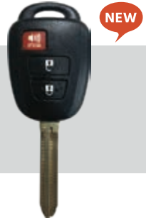
SSC Part #: 5941440 Button Function: L, U, P