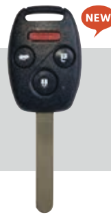
SSC Part #: 5941435 Button Function: L, U, T, P