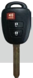
SSC Part #: 5941441 Button Function: L, U, P