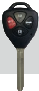
SSC Part #: 5938201 Button Function: L, U, T, P