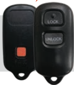
SSC Part #: 5941413 Button Function: L, U, P