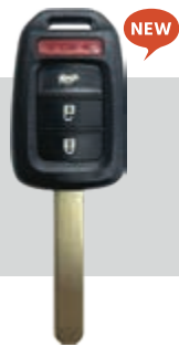
SSC Part #: 5941421 Button Function: L, U, T, P