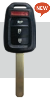
SSC Part #: 5941437 Button Function: L, U, T, P