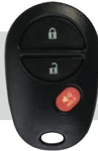
SSC Part #: 5938208 Button Function: L, U, P