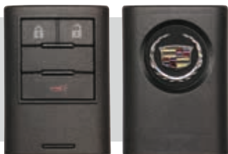
SSC Part #: 5931852 Button Function: L, U, P