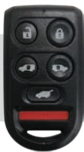
SSC Part #: 5941415 Button Function: L, U, RSD, LSD, LG, P