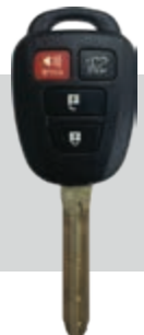
SSC Part #: 5941412 Button Function: L, U, LG, P