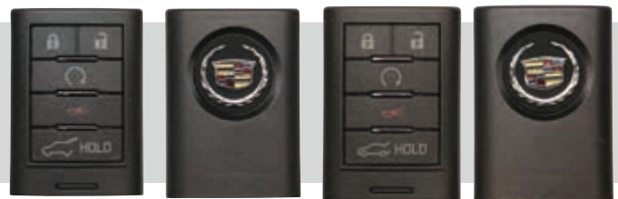
SSC Part #: 5931857 Button Function: L, U, LG, P, RS