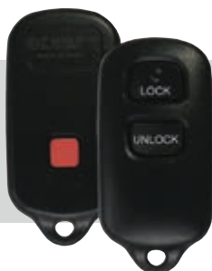
SSC Part #: 5931638 Button Function: L, U, P